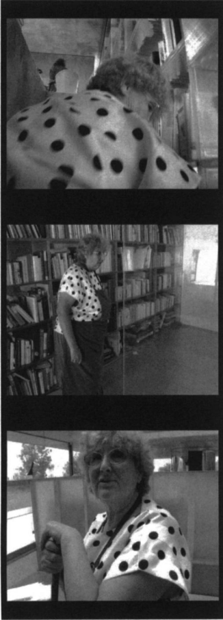
FILM STILLs FROM ILA BÉKA & LOUISE LEMOÏNE, KOOLHAAS HOUSELIFE, 2008. © BÉKA/LEMOÏNE.

7. "A machine was its heart," as Koolhaas says. See OMA, Koolhaas, Living (Basel: Birkhäuser; Bordeaux: Arc en Rêve Centre d'Architecture, 1998), 62.