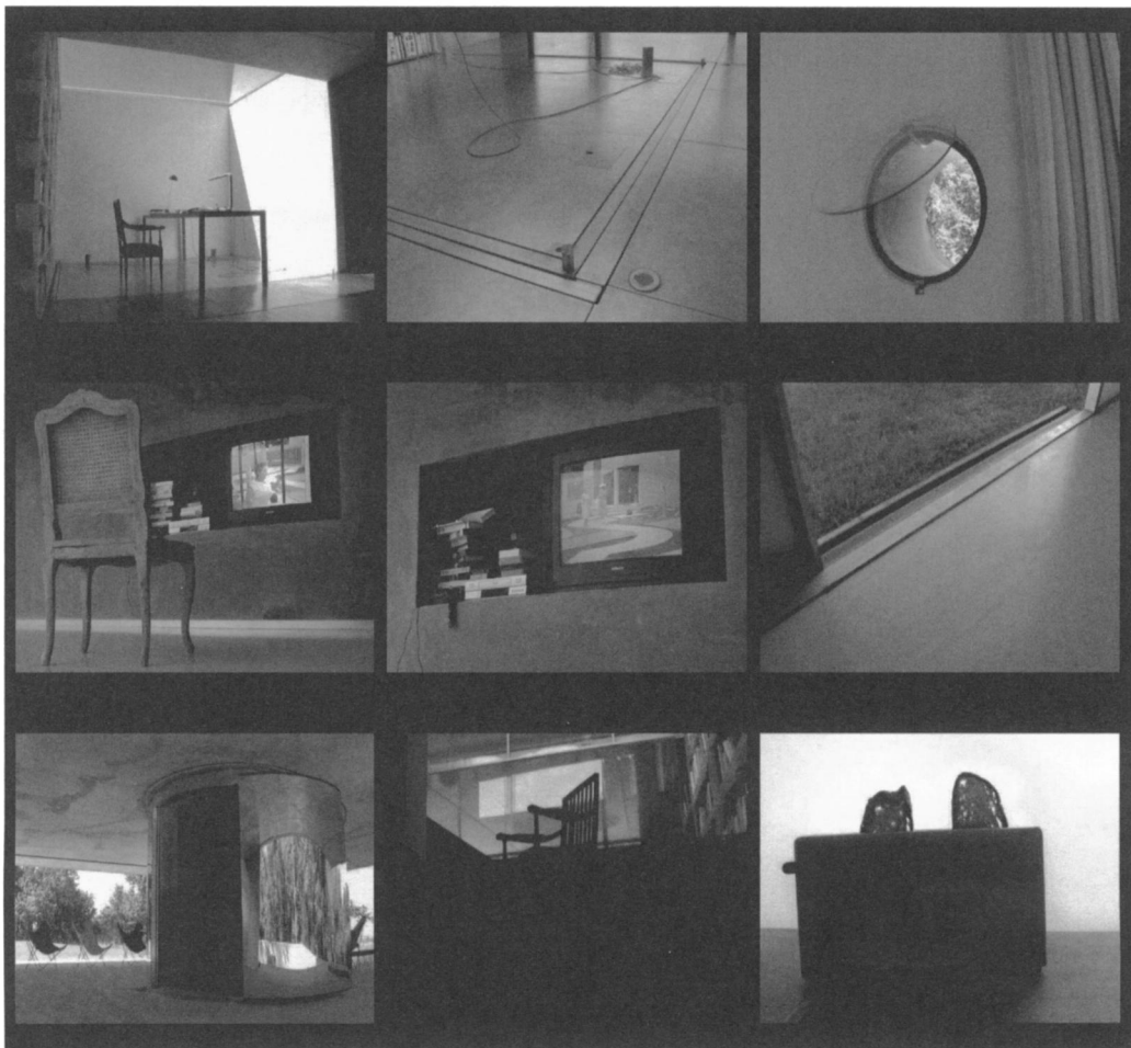
FILM STILLS FROM ILA BÉKA & LOUISE LEMOÎNE, KOOLHAAS HOUSELIFE, 2008.